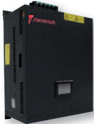
FINSVG.(030 - 100)